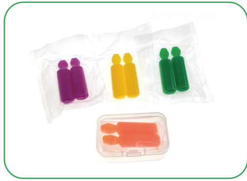
• 81-10006 Chewies,Flat yellow/purple/white/orange 2pcs/box