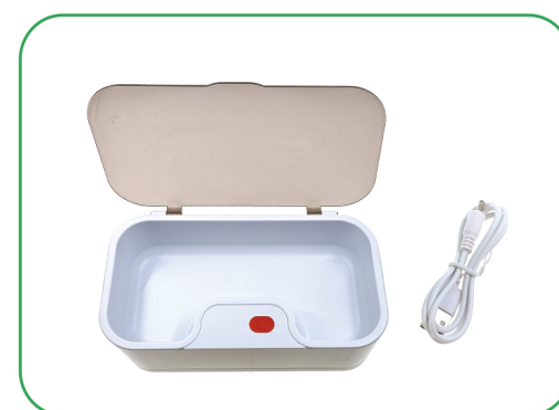
• 81-10020 Braces cleaning machine Without UV sterilization 1pc/box