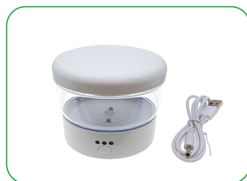
• 81-10019 Braces cleaning machine With UV sterilization 1pc/box