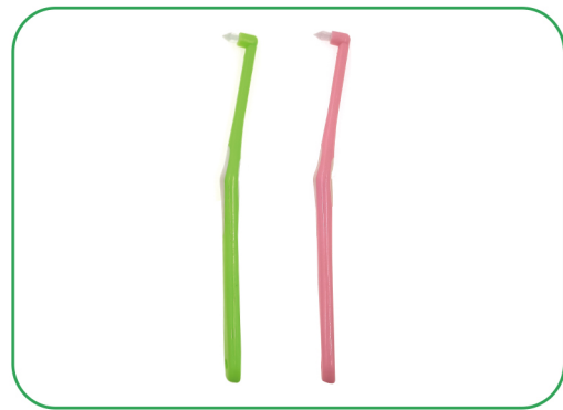
• 81-10013 Single bundle brush green,pink 1pc/card