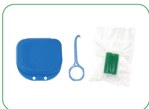
• 81-10027 Surgical tip-Lamellirostral (Large,16mm) 50pcs/bag,20bags/ctn