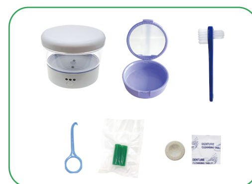
• 81-10030 Saliva ejector (color tip/clear body) Stainless steel wire 100pcs/bag,10bags/ctn