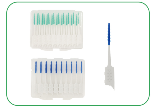
• 81-10016 Interdental brush(silicone,massage) green. blue 20pcs/card