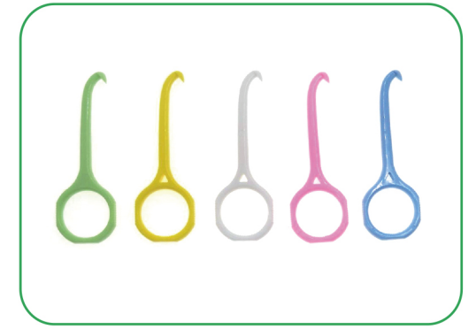
• 81-10011 Invisible braces extractor green\yellow\white\pink\blue 1pc/card