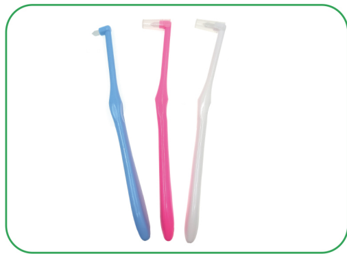
• 81-10012 Single bundle brush (Monochrome handle) blue,pink,white 1pc/card