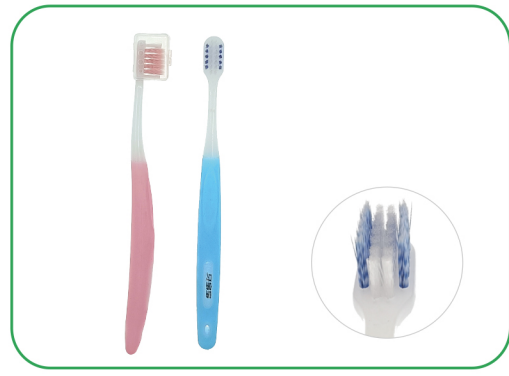
• 81-10002 Orthodontic toothbrush(U-sharp) pink,blue 1pc/card