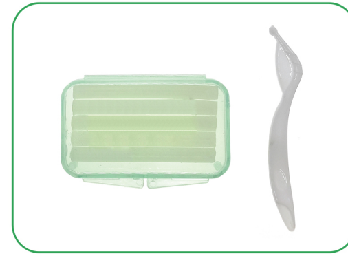
• 81-10010 Orthodontic wax+Wax knife 1 set/card