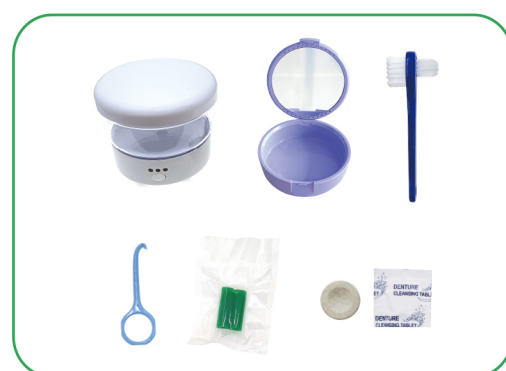
• 81-10029 Saliva ejector (Clear tip/color body) Copper plated wire 100pcs/bag,10bags/ctn