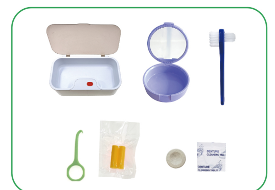
• 81-10031 Saliva ejector (Clear tip/color body) Stainless steel wire 100pcs/bag,10bags/ctn