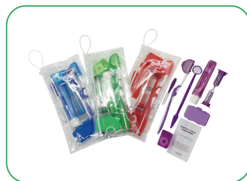
• 81-10024 Orthodontic kit-poly bag package,8pcs blue,red,green,purple