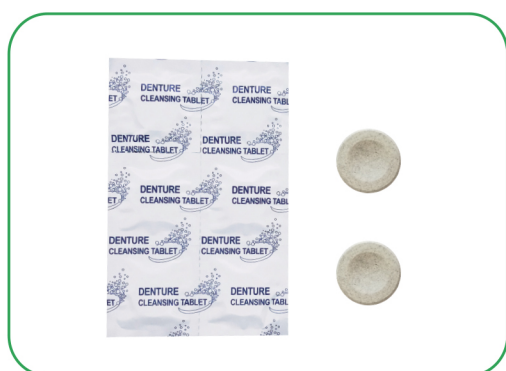
• 81-10017 Denture cleansing tablet 30pcs/box