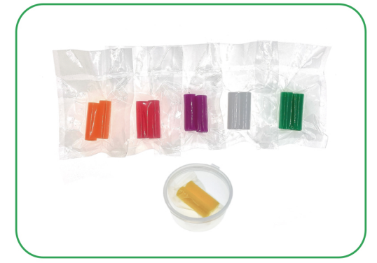
• 81-10005 Chewies, round Without glue stick Orange/red/yellow/purple/white/green 2pcs/box