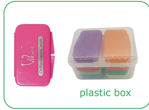
• 81-10008/10009 Orthodontic wax,mixed 10pcs/plastic box 100pcs/paper box