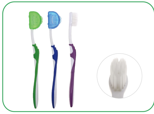
• 81-10001 Orthodontic toothbrush (V-sharp) green,blue,purple 1pc/card