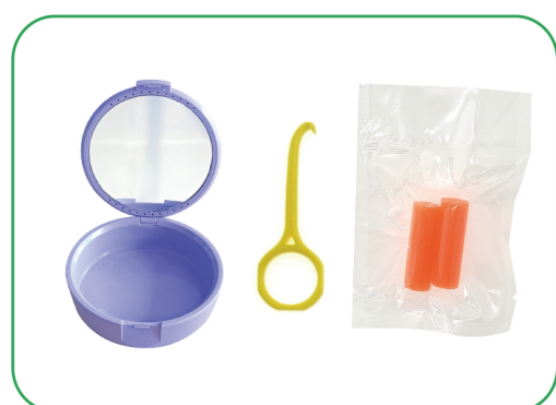
• 81-10028 Saliva ejector (color tip/clear body) Copper plated wire 100pcs/bag,10bags/ctn