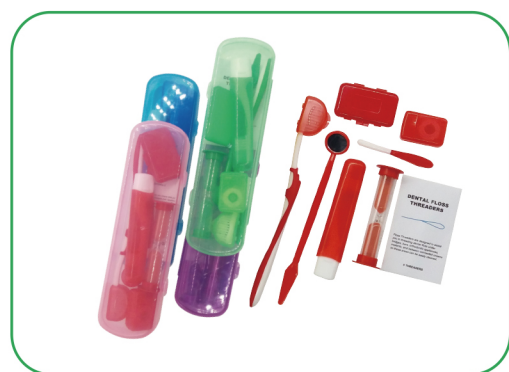
• 81-10023 Orthodontic kit-box package,8pcs blue,red,green,purple