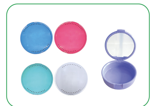
• 81-10021 Retainer box, With mirror round blue,pink,blue,white,purple 1pc/box