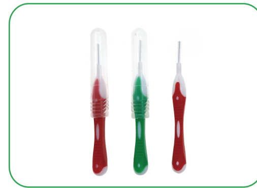
• 81-10015 Interdental brush(I-sharp) red. green 5pcs/card