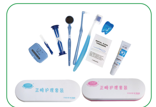
• 81-10026 Orthodontic kit-box package,9pcs blue,pink