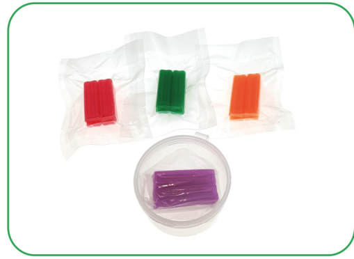
• 81-10007 Chewies, square red/purple/green/orange 2pcs/box