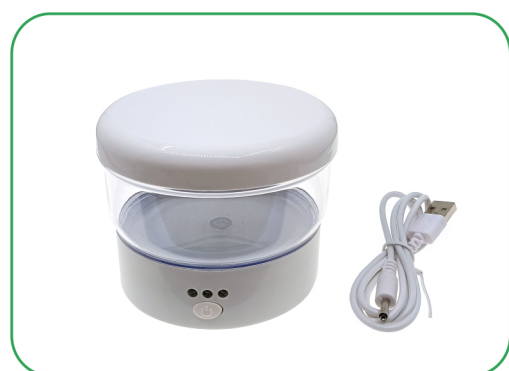
• 81-10018 Braces cleaning machine Without UV sterilization 1pc/box