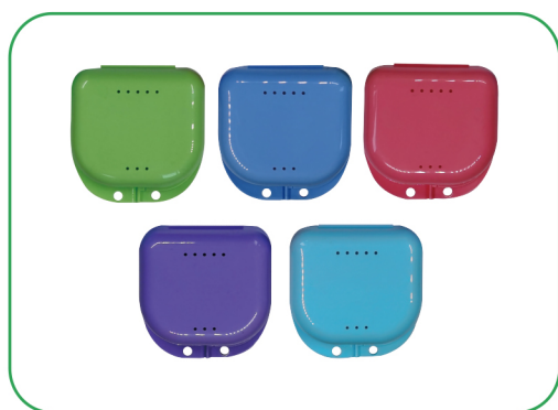
• 81-10022 Retainer box, square 10pcs/box mixed