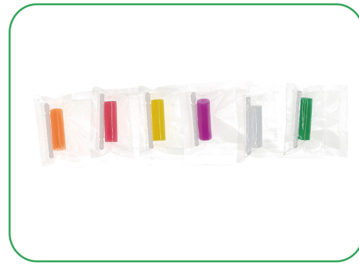
• 81-10003 Chewies, round With 1 glue stick + 1 chew Orange/red/yellow/purple/white/green 1set/bag