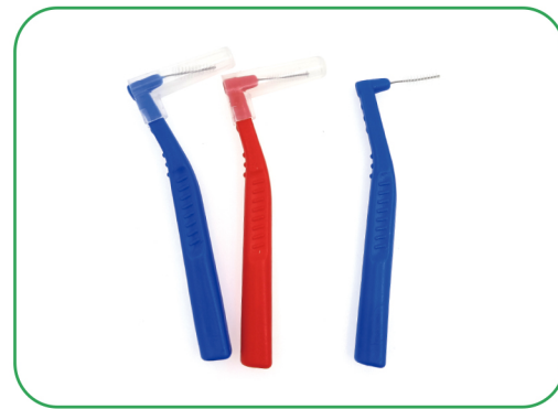
• 81-10014 Interdental brush(L-sharp) blue. red 5pcs/card