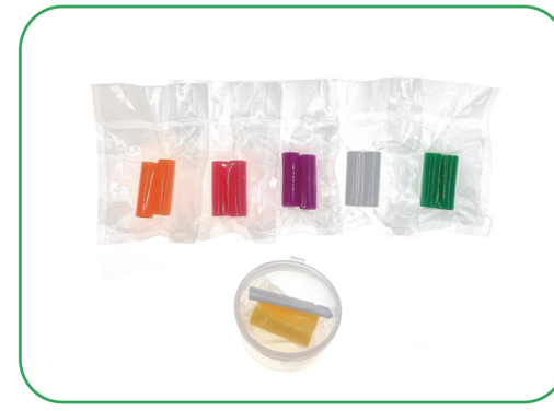
• 81-10004 Chewies, round With 2 glue sticks + 2 chewies Orange red /yellow/purple/white/green 1set/bag