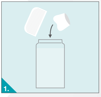
Open the VALL BOND<sup>™</sup> vial. Into the vial insert a clean prosthetic restoration in a way to avoid the trapping of air bubbles.