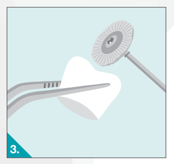
Remove the coated prosthetic restoration from the solution and dry it. By using the polishing brush clean the coating from the surfaces which will not be cemented.