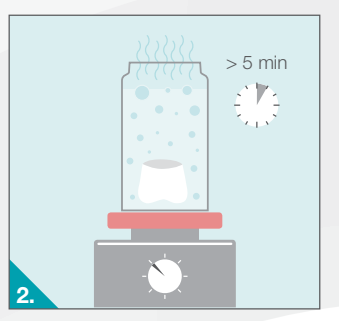
Put the open vial with inserted prosthetic restoration on the heater plate. Bring the VALLEOND<sup>TM</sup> solution to a boil and then leave it to boil for 5 minutes. When the solution becomes turbid, the coating synthesis is completed. Take the vial off the heater.