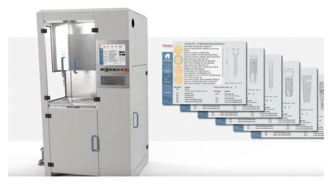
The ST200 unlimited programmability enables to tailor a dedicated blasting program for each part reducing fabrication downtime and errors.