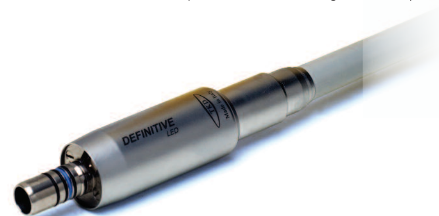
DEFINITIVE®LED brushless electric micromotor