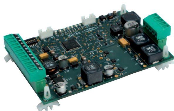
BMC60 special motor drive

A micromotor for Implantology is also available.