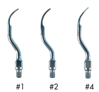
Supplied inserts are: Universal (#1), Extra-fine (#2) and Spatula (#4).

Scaler is available with standard 3-hole or 4-hole connection.