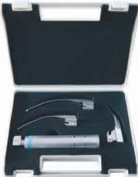
Macintosh Conventional 1 Handle + 3 Blades