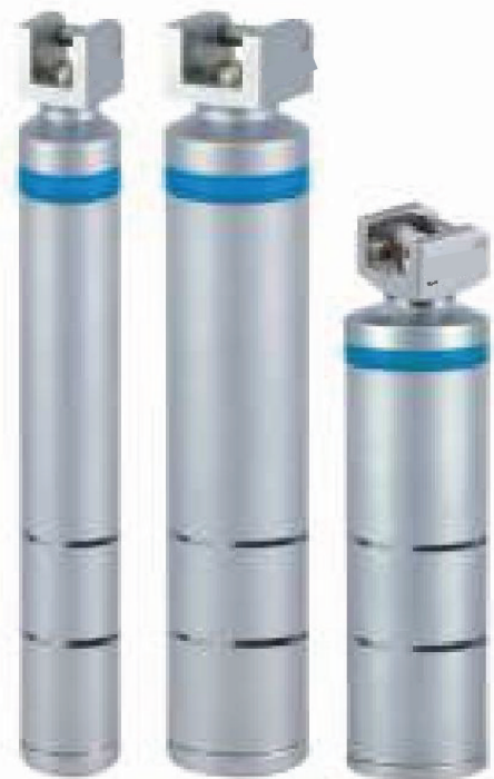
Conventional Battery Handles