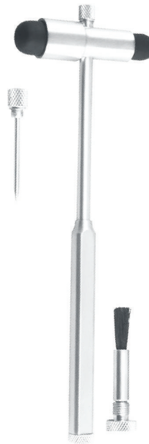
Buck With Needle and Brush Size : 180 mm