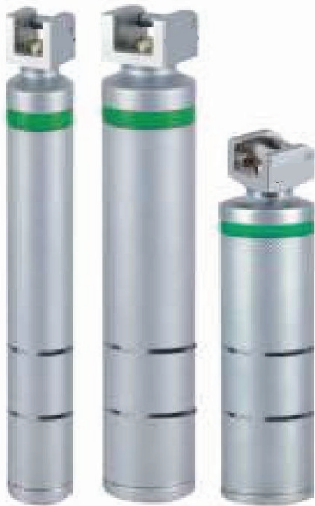
Fiber Optic Battery Handles