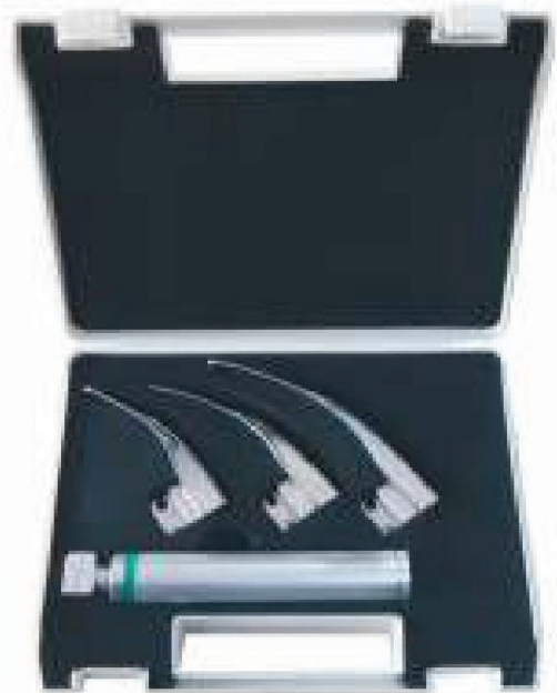
Macintosh Fiber Optic 1 Handle + 3 Blades