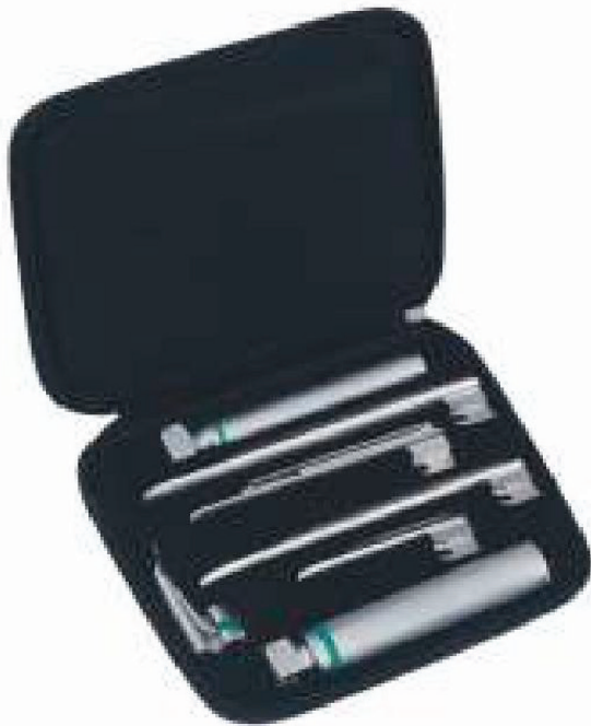
Miller Fiber Optic 2 Handles + 5 Blades