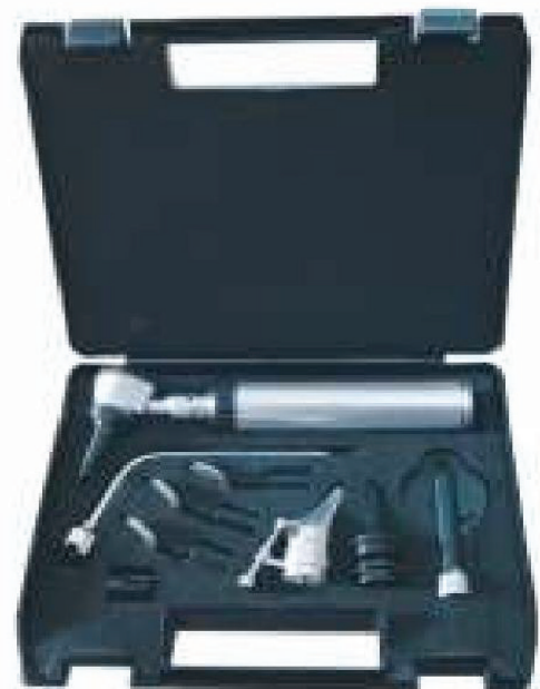
ENT Set 2.5 V With Accessories