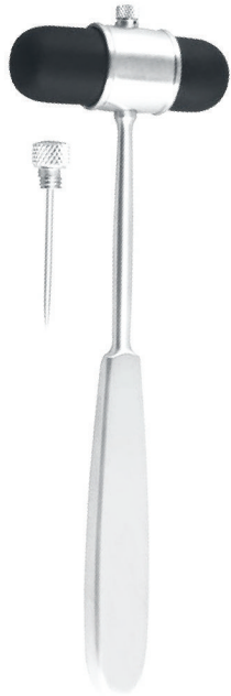
Dejerine Size : 200 mm