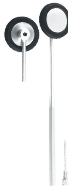
Rabiner With Needle Size : 265 mm