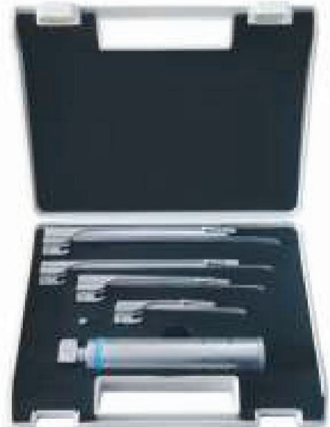
Miller Conventional 1 Handle + 4 Blades