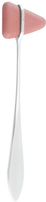
Taylor Size : 195 mm