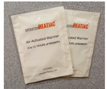
Air activated heat packs placed inside pockets