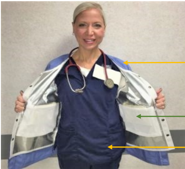
Outer scrub jacket

Note: One can place 2 or 4 air activated heat packs in the inside pockets of the insulating vest depending on how warm you want to be. One can also place an IV bag on each side in the 2 larger interior pockets.