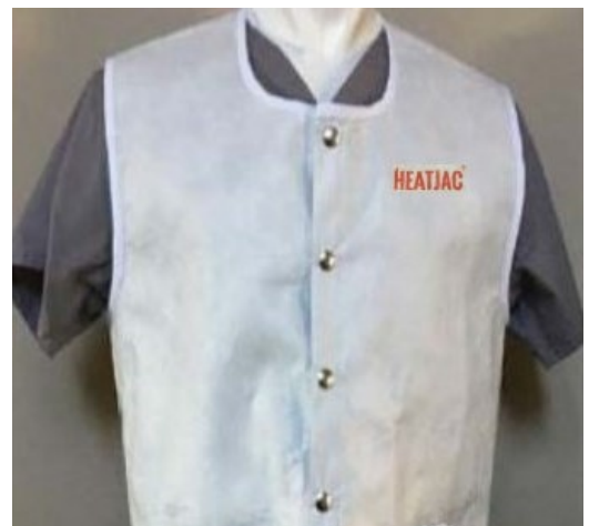
Insulating Vest worn over inner scrub